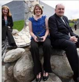
2008 Newstalk Student Enterprise Competition

IT Sligo students achieving success at national and international level in 2008