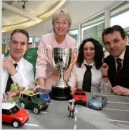
Imagine Cup, 2008