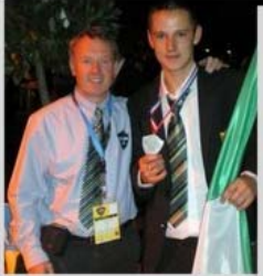
Silver Medal Euroskills Joinery